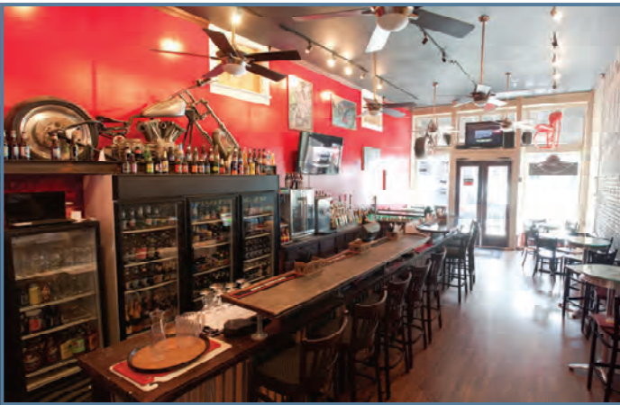
First Floor Bar